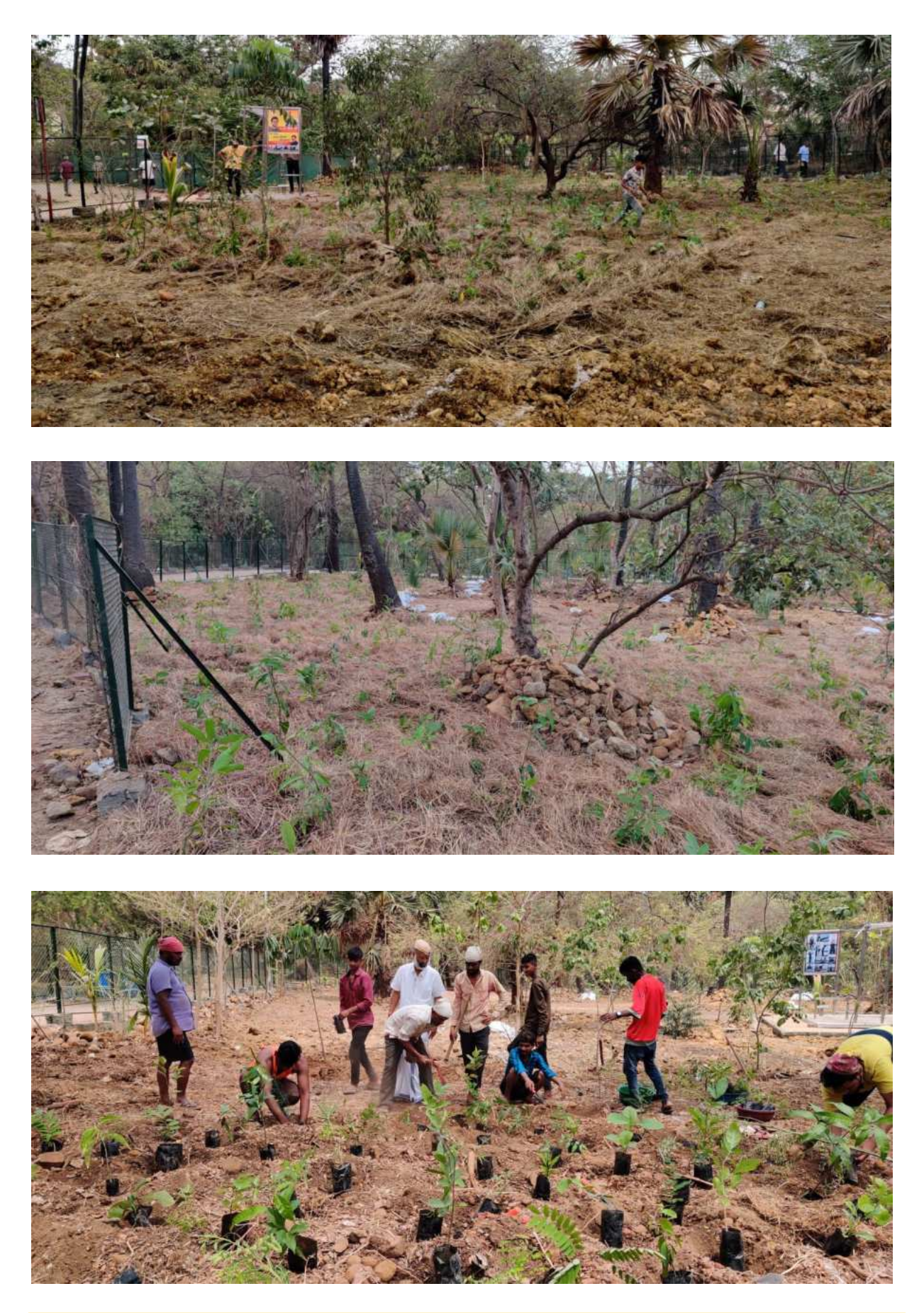
Mulching with dry straw