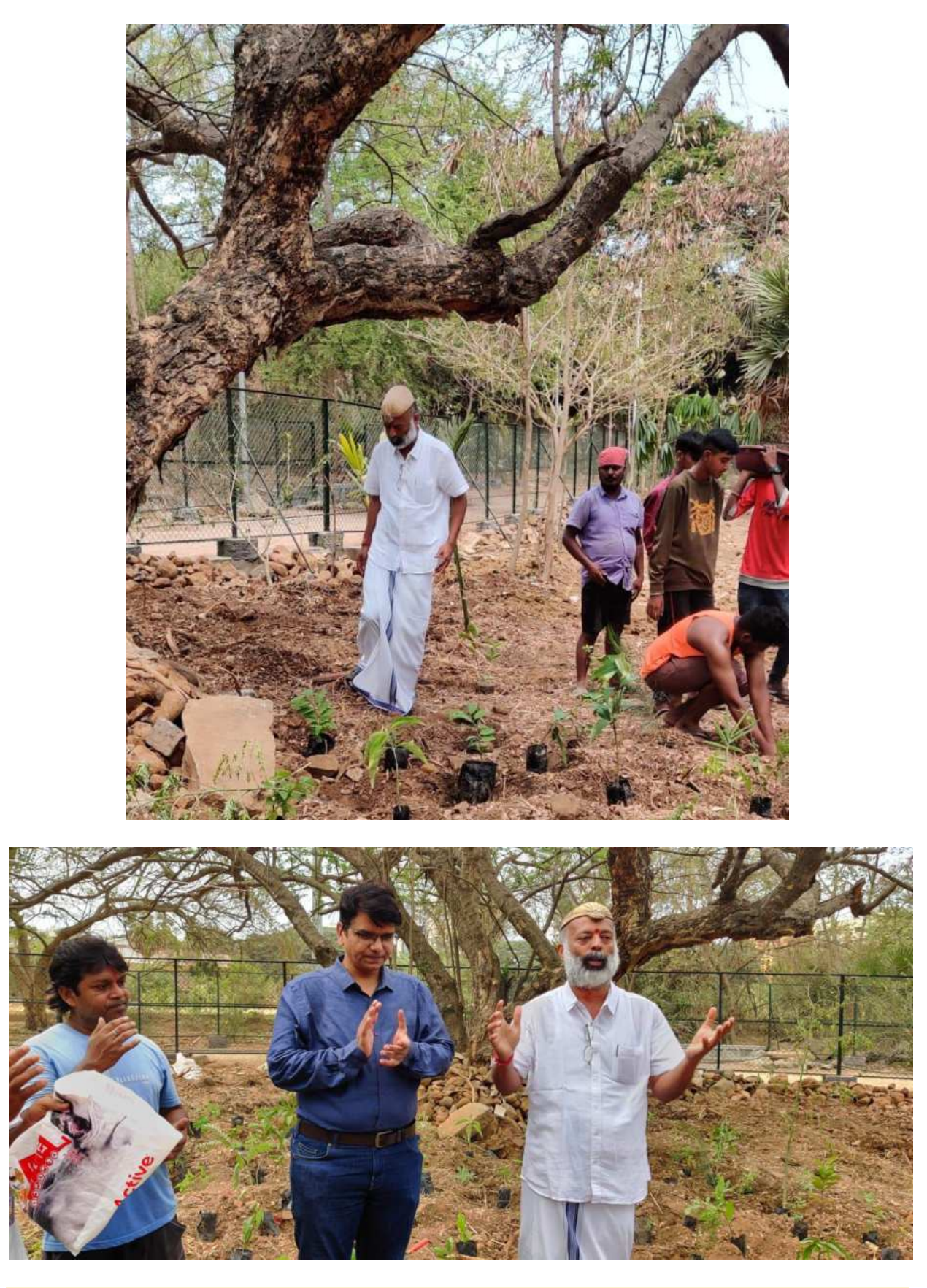
5<sup>th</sup> June 2022: Plantation begins.....