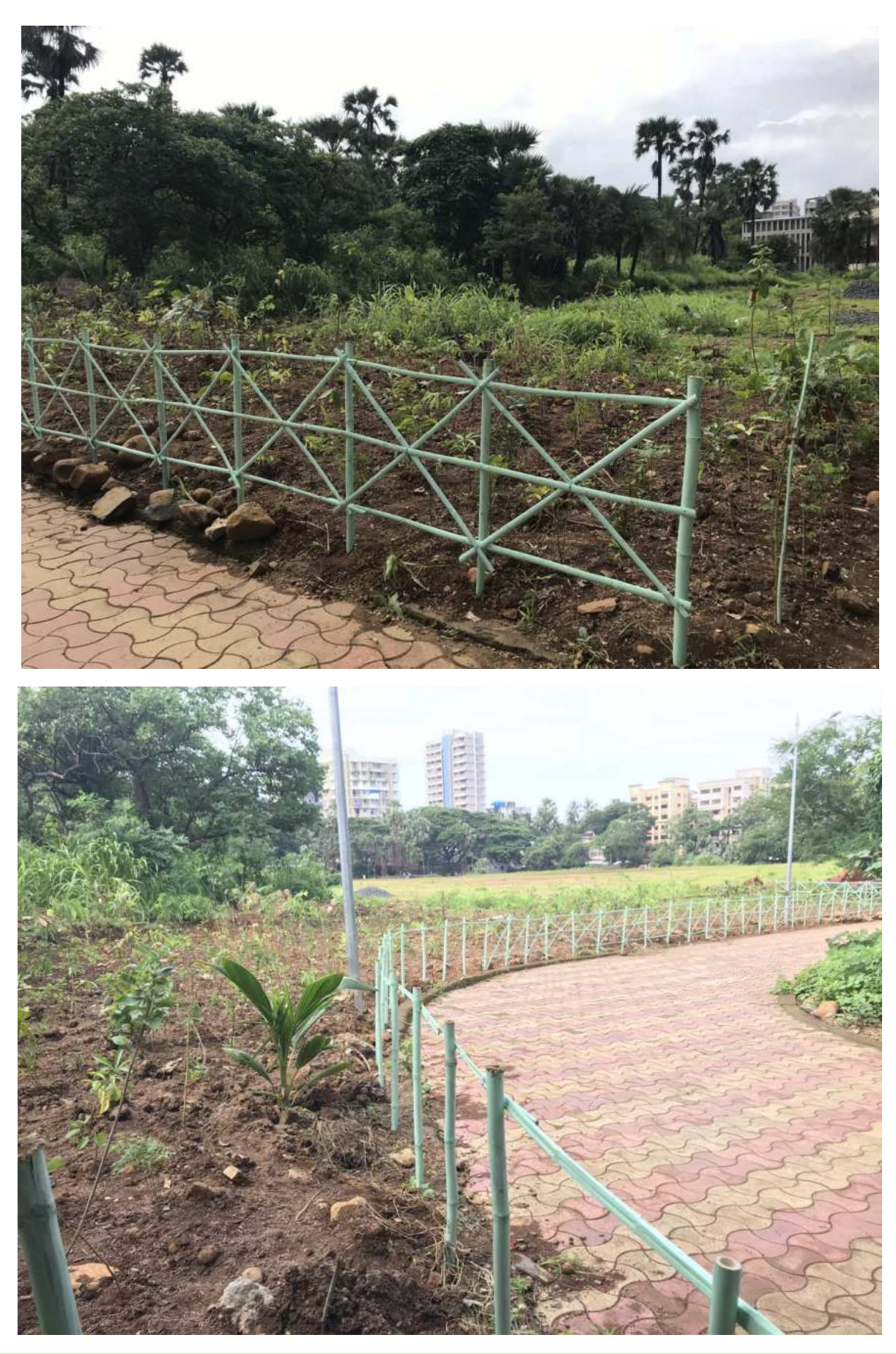
22<sup>nd</sup> August 2019