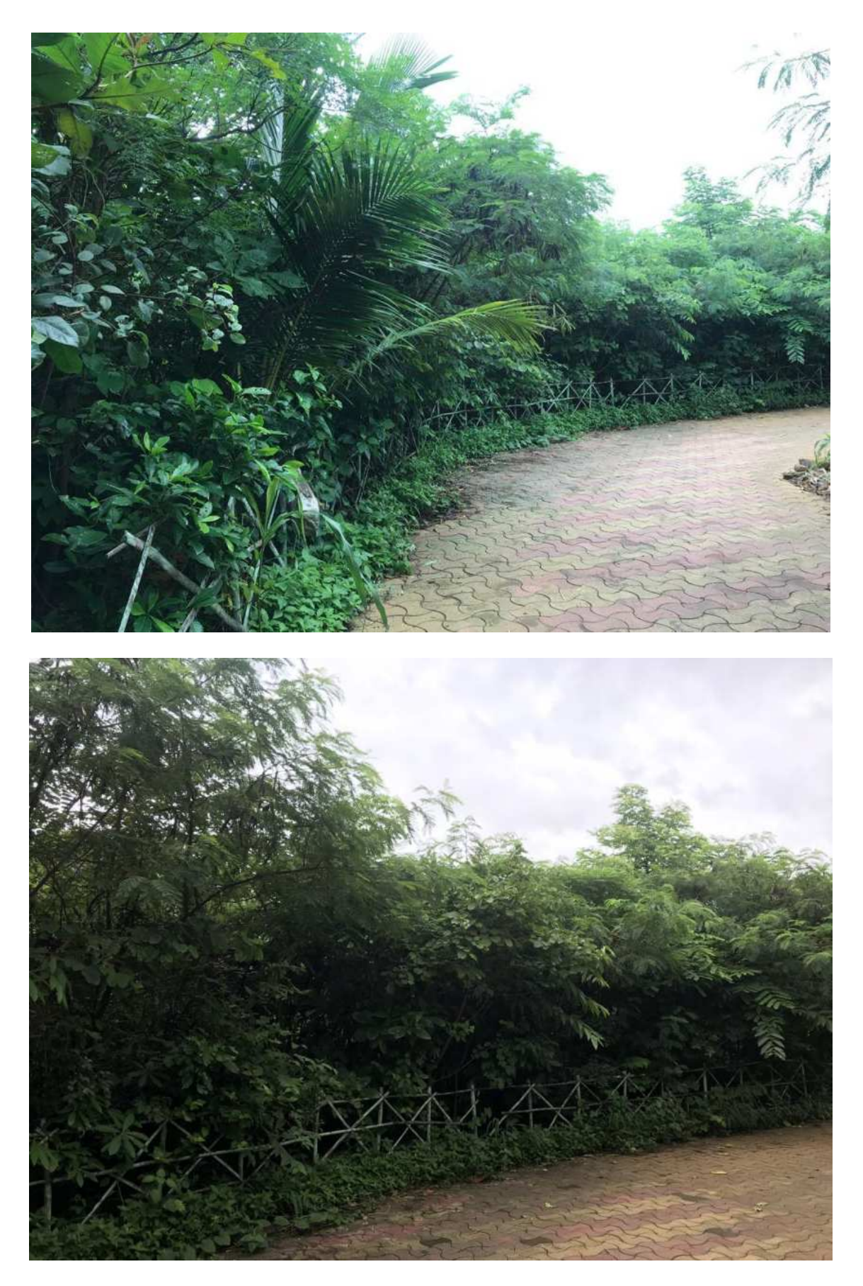
22<sup>nd</sup> August 2021