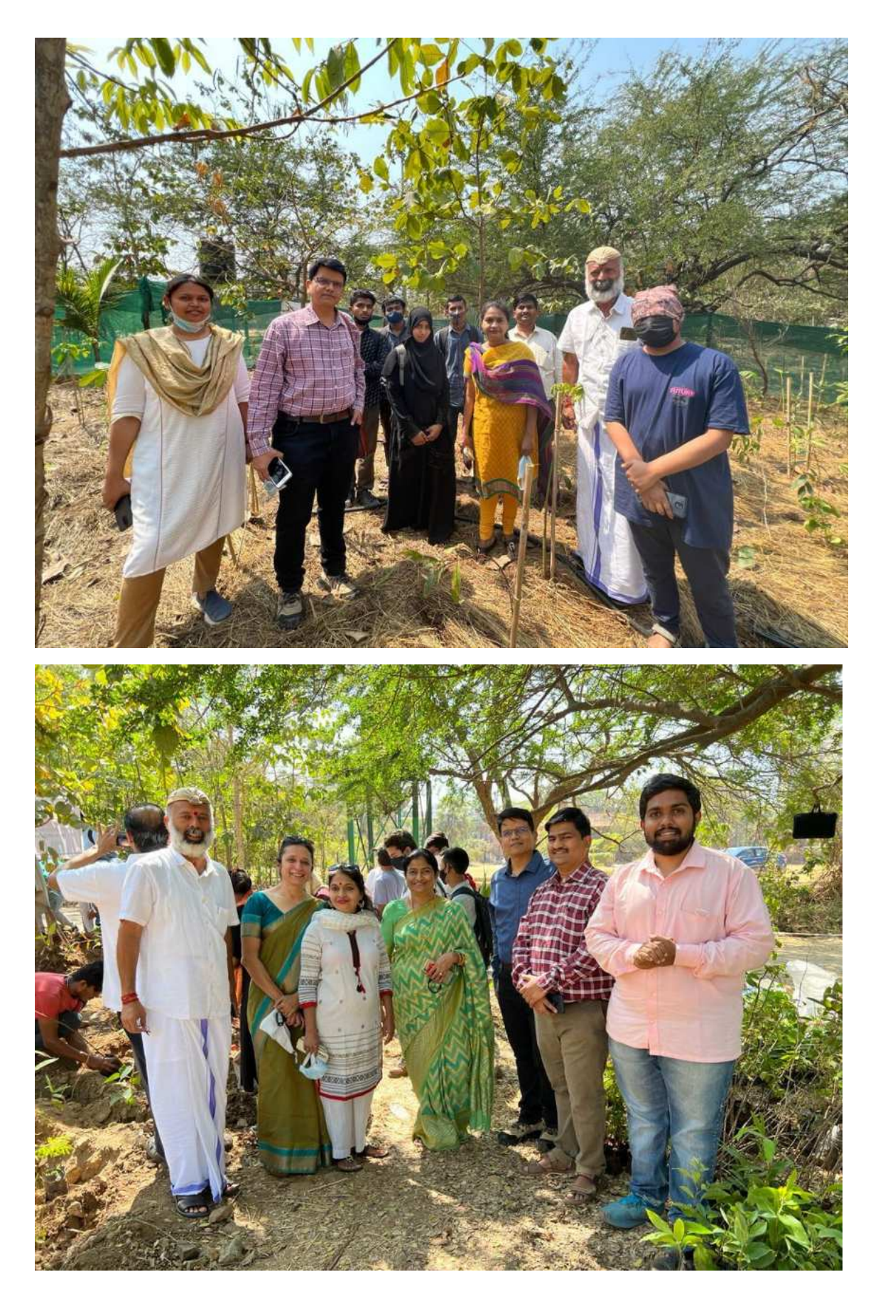
16th & 17th February 2022