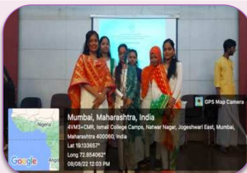
Azadi ka Amrut mahotsav- Department of History