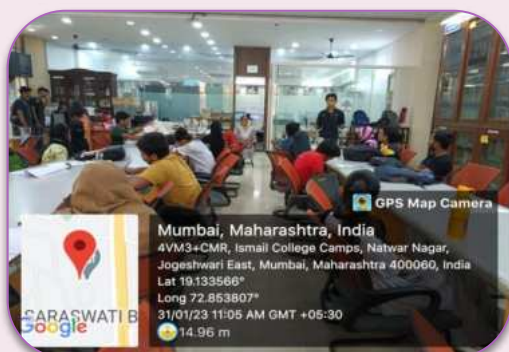
Book club activity-Main Reading Hall, Library