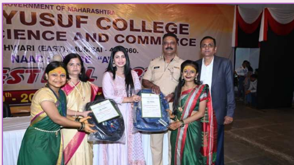
PALMS Festival prize winners with the dignitaries at the Prize Distribution ceremony