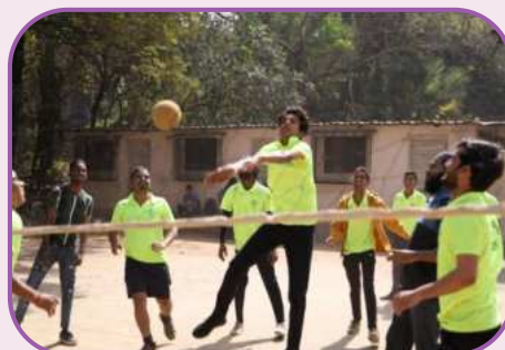
Boys enjoying volley ball