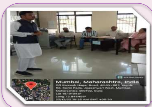
Poem reading- Department of Urdu