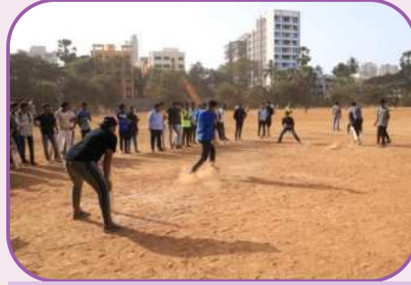
Box cricket match