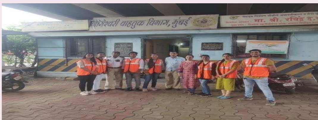
• NSS volunteers assisting traffic police during Ganesh Visarjan