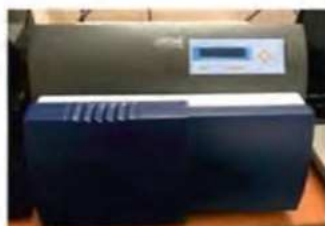
Documentation (HPTLC Visualizer and Scanner)