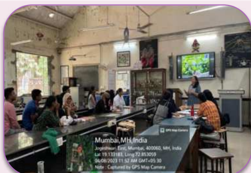
Career guidance session-Zoology Laboratory