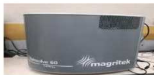
60 MHz NMR SPECTROPHOTOMETER