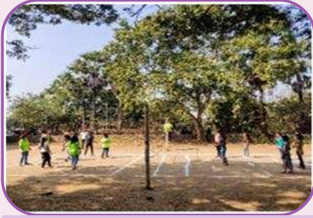
Girl students enjoying Throw Ball match at the Annual Sports