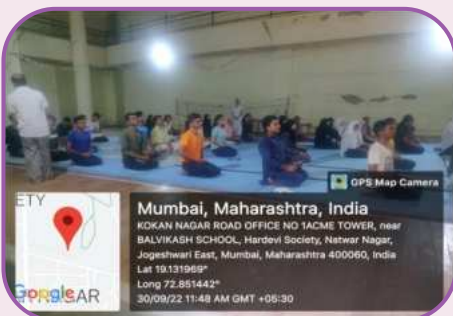
Students practicing in the Yoga camp in association with AmbikaYog Kutir