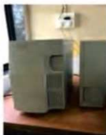
Liquid Chromatography- Mass Spectrometry System (LC-MS)