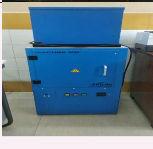
Instruments in the Physics Laboratory