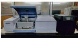
FT-IR SPECTROPHOTOMETER WITH ATR