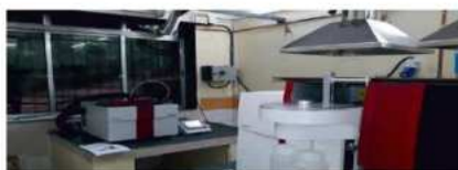
Atomic Absorption Spectrophotometer (AAS) (AAS Laboratory, Department of Zoology)