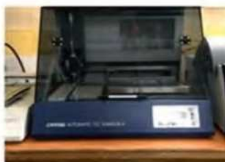
Applicator (Linomat 5 and Auto Sampler 4)