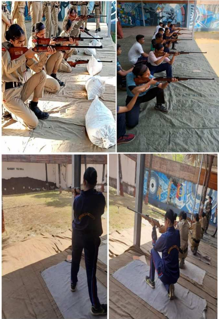
NCC-Girls in the Firing Camp