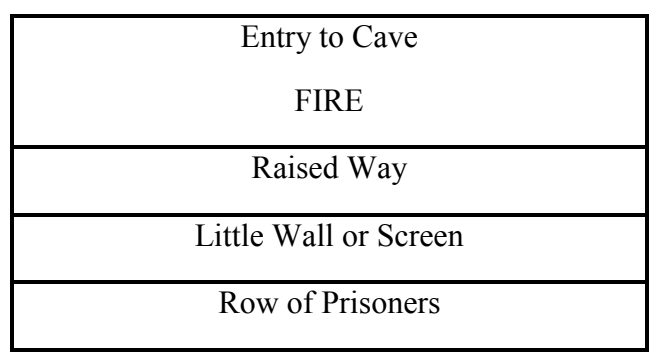
Wall on which shadows are cast

Plato has given the most famous "Allegory of the cave" in Republic. The Allegory of Cave describes the ascent of the soul from the region of - Darkness (Conjectures and Imaginations) to the region of Light (Dialectic and Truth). The man who reaches the region of Light can guide the state affairs and deserves to be the 'Philosopher King'. In the analogy of Cave, Plato shows the ascent of the mind from illusion to truth and pure philosophy. Plato also shows the difficulties in the progress of soul towards Truth.