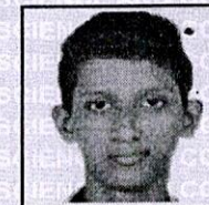
Student Id 5328