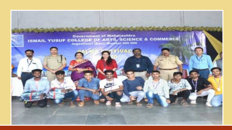
PALM FESTIVAL Prize winners with the dignitories at the Prize Distribution ceremony