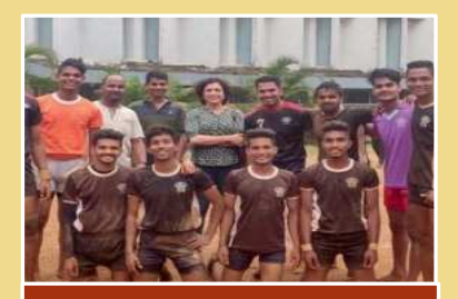
The victorious Kabaddi team