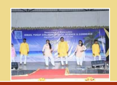
Palms Cultural Event