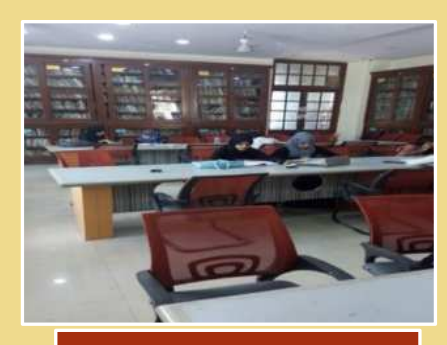
Urdu Library Section