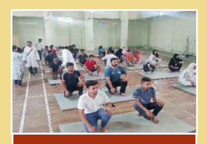
Students practicing Yoga at the YOGA WORKSHOP