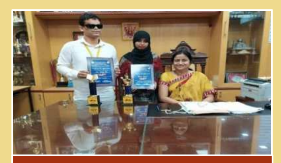
Intercollegiate competition winners two of our Divyang students are appreciated by the